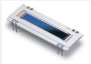
Silicon Position Sensing Detector

A compact carrying case (standard) houses the entire system: the OT-5000 RLT Rotating Laser Targets that detect and display the position of the rotating laser, the OT- 5000 DIM Digital Interface Module that provides power for up to twenty OT-5000 RLTs, and the cables.