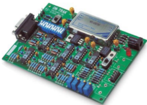
OT-301DL - Position Sensing Amplifier For Duolateral PSDs